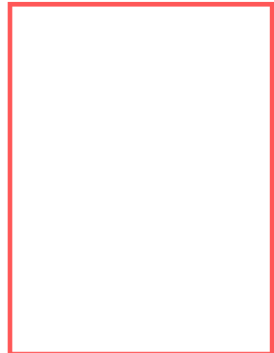
TBD based on project Superintendent